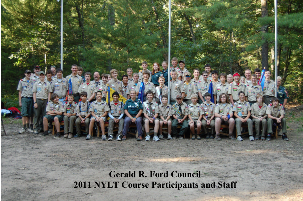
Gerald R. Ford Council 2011 NYLT Course Participants and Staff

The NYLT course is intended to strengthen the relationship between the Scout or Venturer and their adult leader. Participant's adult unit leaders are asked to attend the closing feast to discuss the youth's leadership goals, conference participation on Saturday, August 11 th at Gerber Scout Camp. Participant's parents do not attend the closing feast.